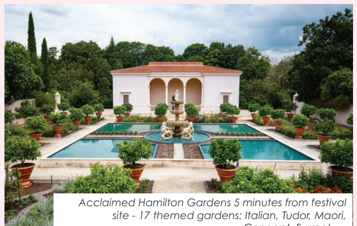
Acclaimed Hamilton Gardens 5 minutes from festival site - 17 themed gardens: Italian, Tudor, Maori, Concept, Surreal, ...