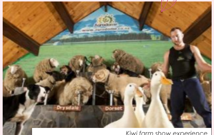
Kiwi farm show experience