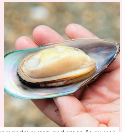
Fresh Coromandel oysters and green-lip mussels