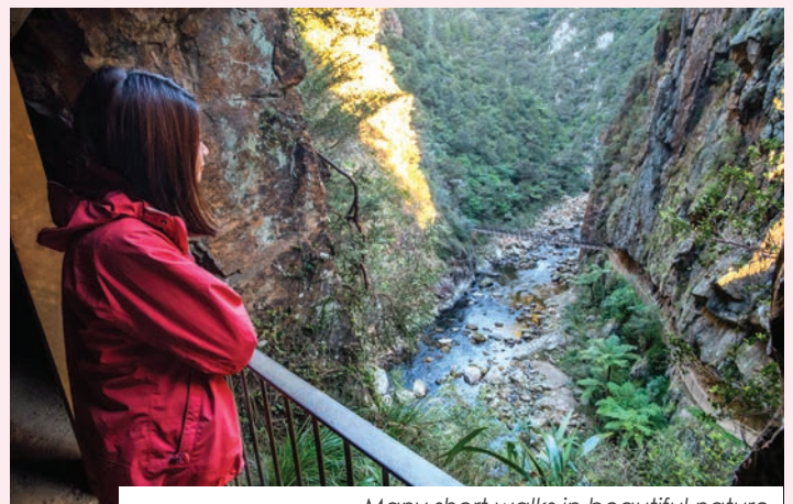
Many short walks in beautiful nature